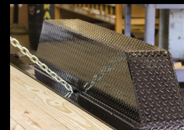
Tie Down Between Fenders (flush w/deck & fenders)