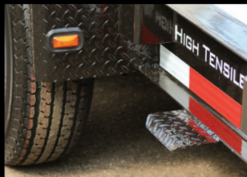
Step To Access Deck