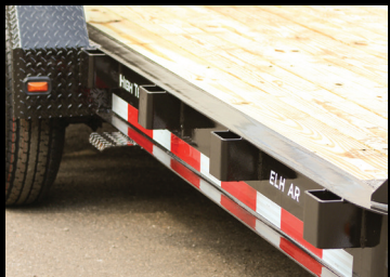
Heavy Duty 4" x 1/4" Bar Stake Pockets