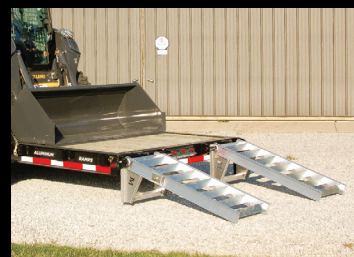
Heavy Duty 4" Channel Aluminum Ramps These Ramps Tested Stronger Than our 3" Steel Channel Ramps on our Previous Model