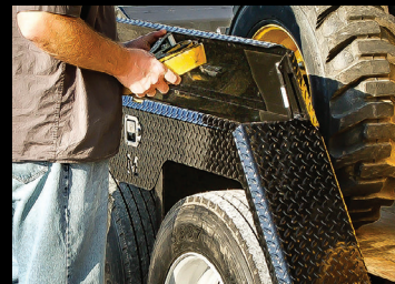
Optional Fender Tool Boxes (ratchet boomer storage)