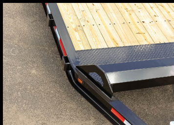
Cold Formed 8" I Beam