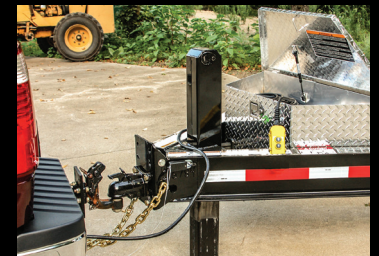
Optional Hydraulic Jack