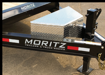
Aluminum Tool Box